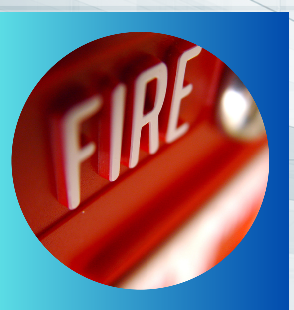
Fire Safety Solutions